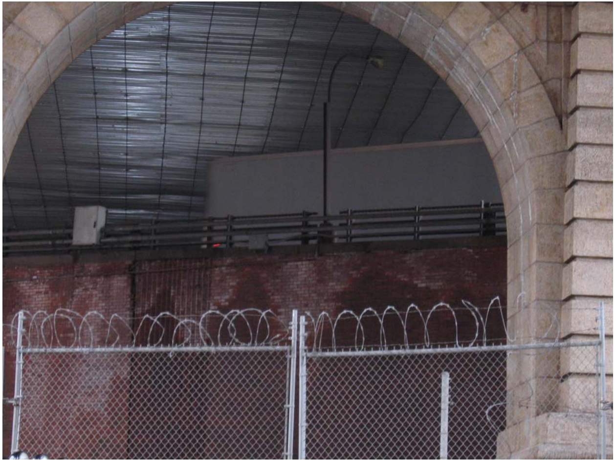
Cable/Metal Deck Platform Center Roadway Brooklyn