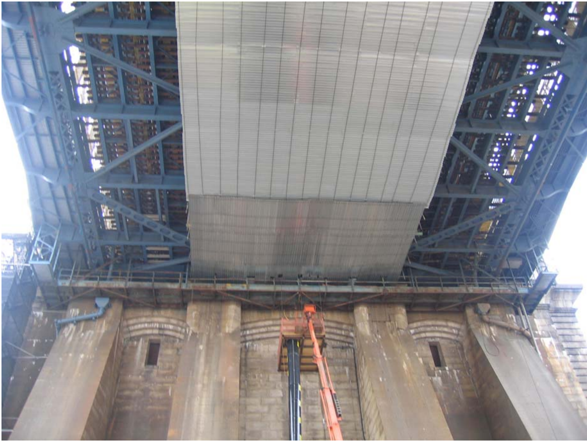
Cable/Metal Deck Platform Center Roadway