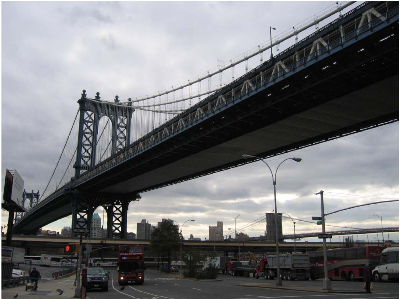
Cable/Metal Deck Platform Center Roadway