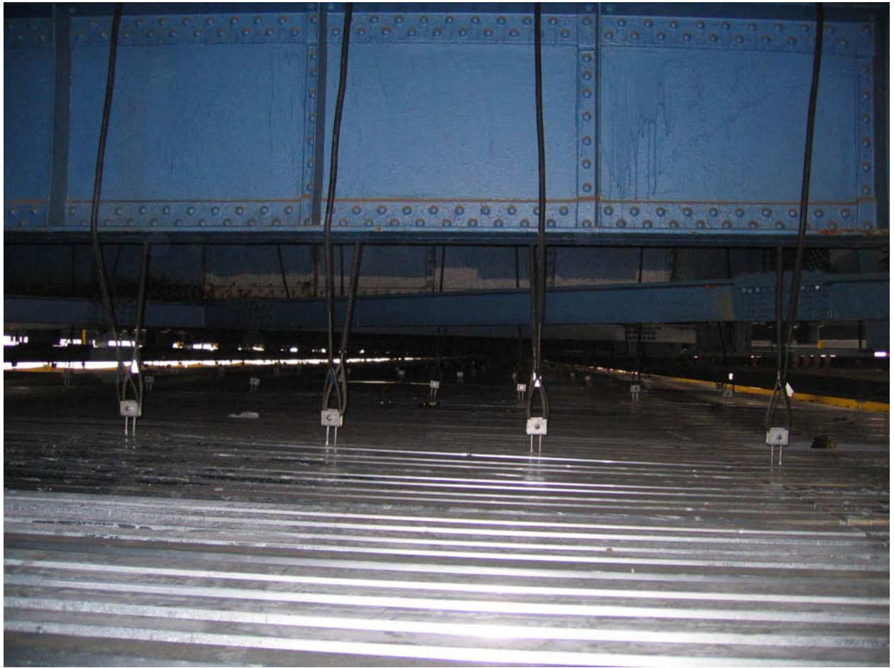
Vertical Tie Ups