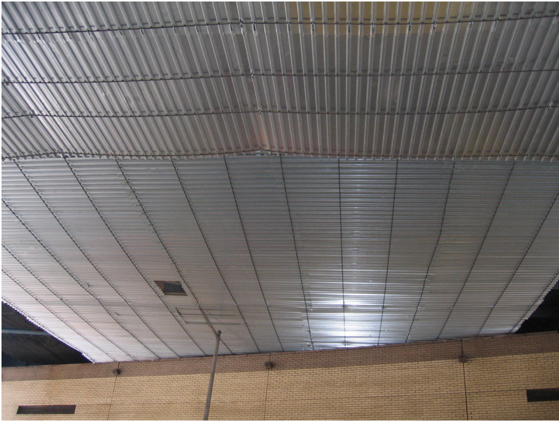
Cable/Metal Deck Platform Center Roadway Manhattan