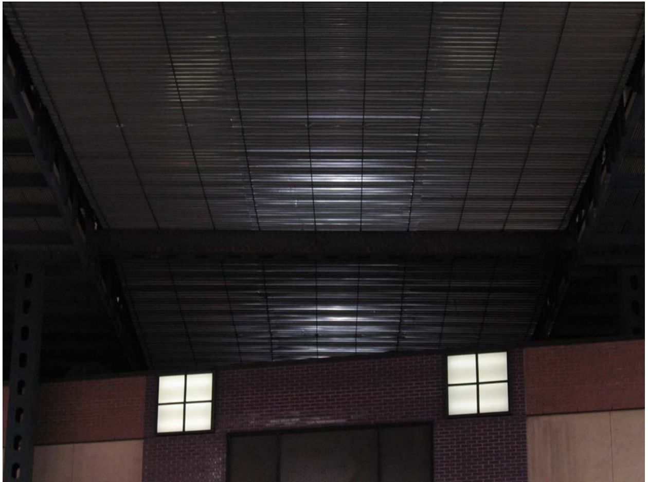
Cable/Metal Deck Platform Center Roadway Manhattan