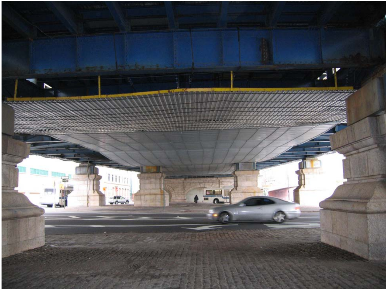
Cable/Metal Deck Platform Center Roadway Brooklyn