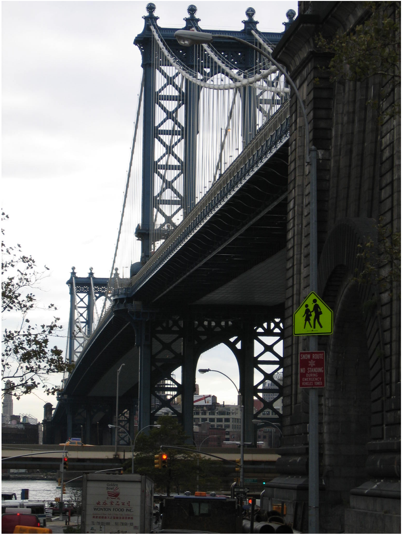
Cable/Metal Deck Platform Center Roadway Manhattan