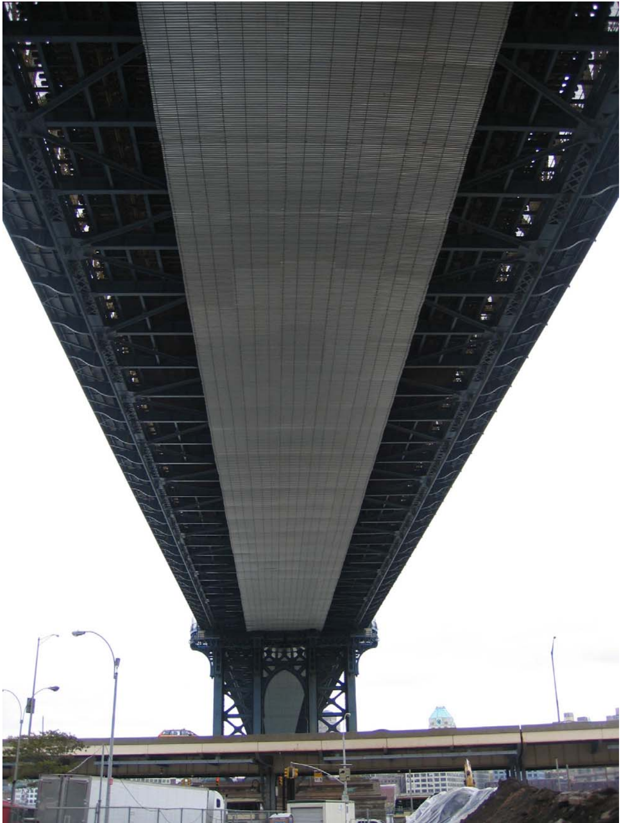
Cable/Metal Deck Platform Center Roadway