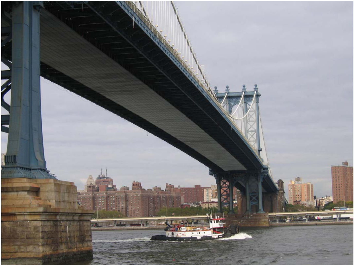
Cable/Metal Deck Platform Center Roadway Main Span