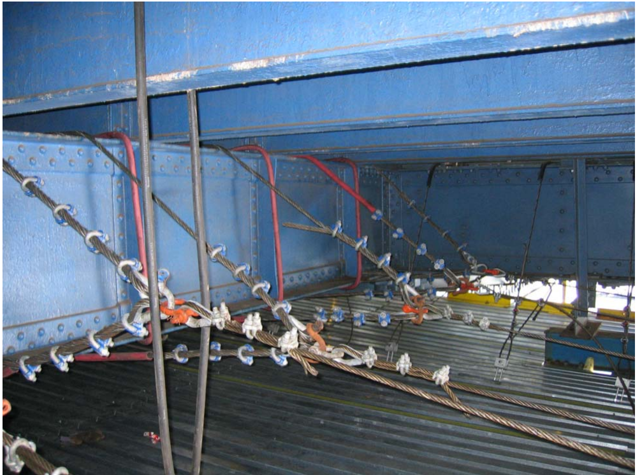
Cable/Metal Deck Platform Center Roadway Jumper Platform