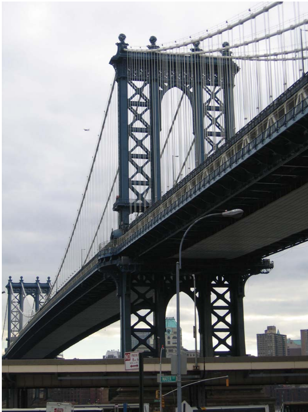
Cable/Metal Deck Platform Center Roadway

Partially installed Cable/Metal Deck Platform Conforming to the Concrete Arch