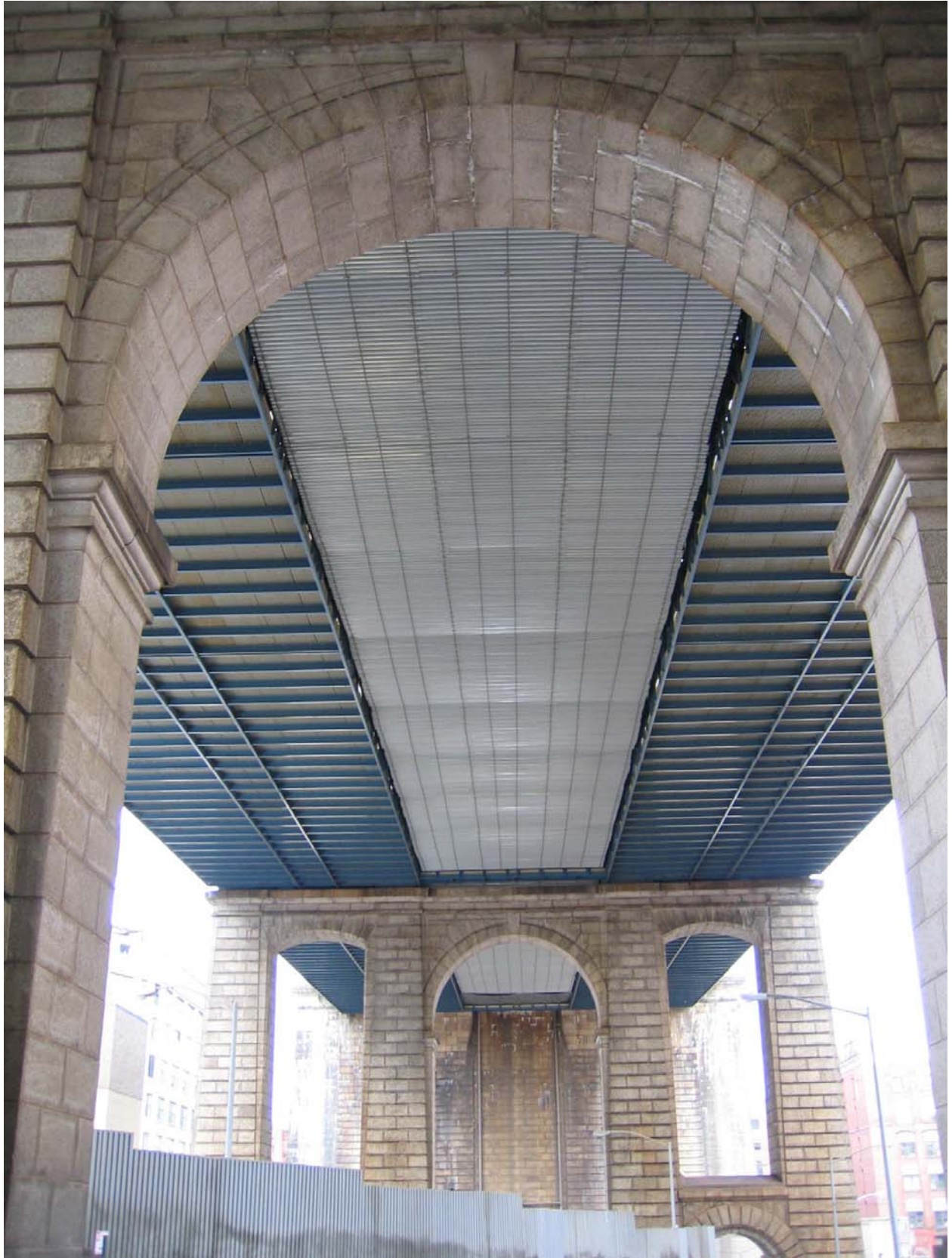
Cable/Metal Deck Platform Center Roadway