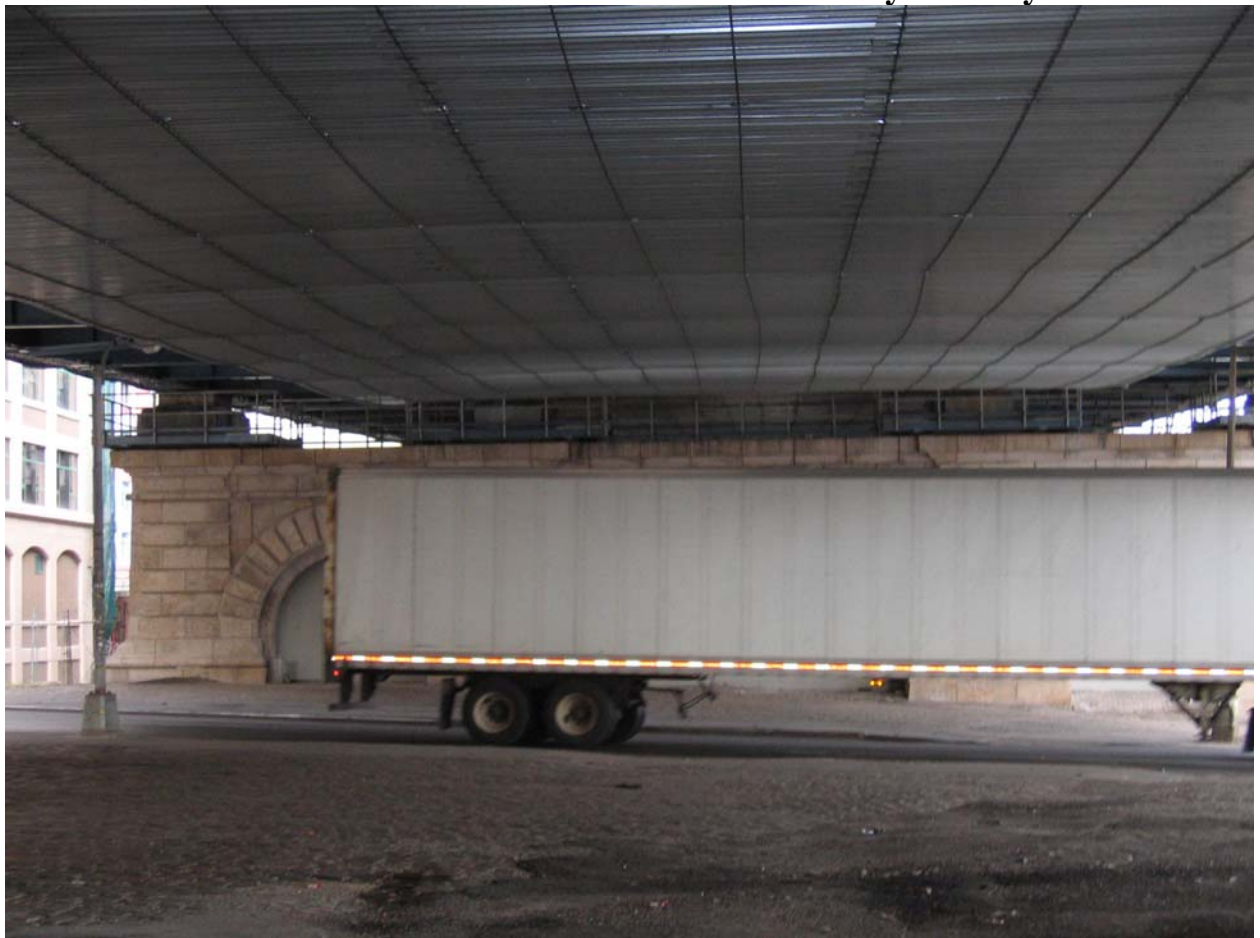
Cable/Metal Deck Platform Center Roadway Brooklyn