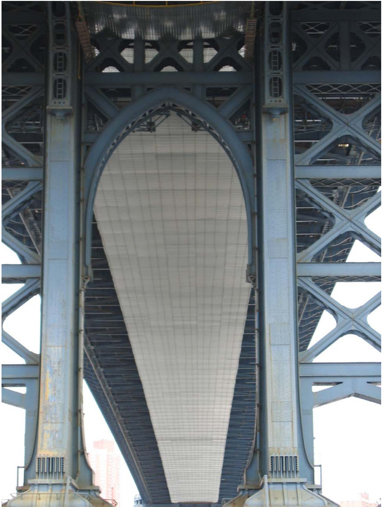
Cable/Metal Deck Platform Center Roadway Main Span