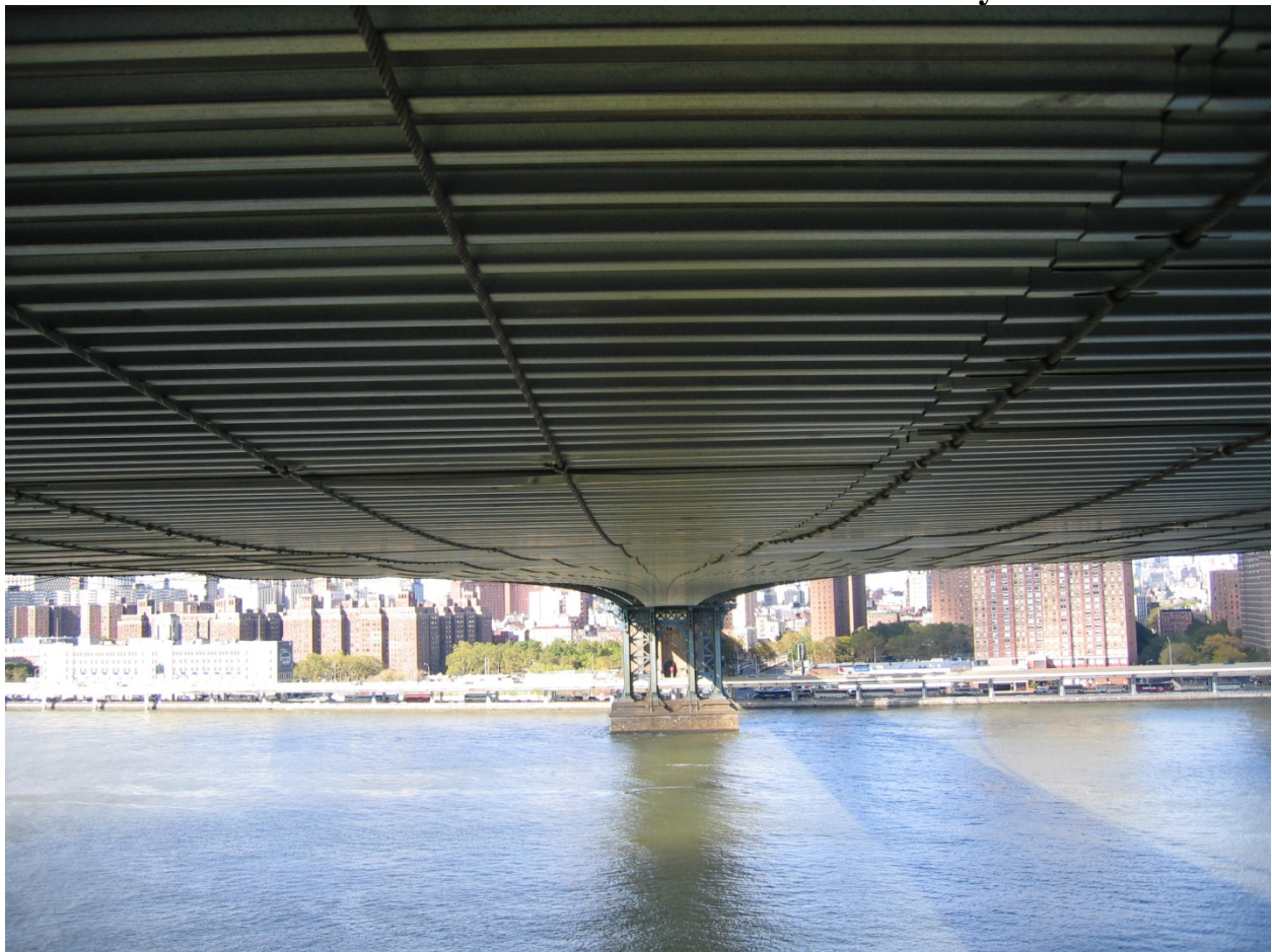
Cable/Metal Deck Platform Center Roadway