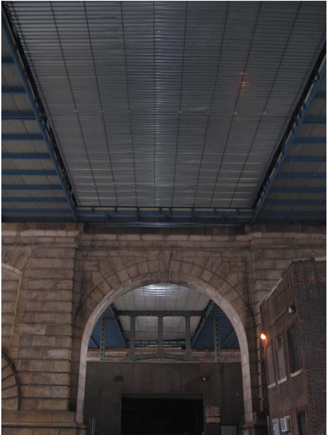
Cable/Metal Deck Platform Center Roadway Manhattan