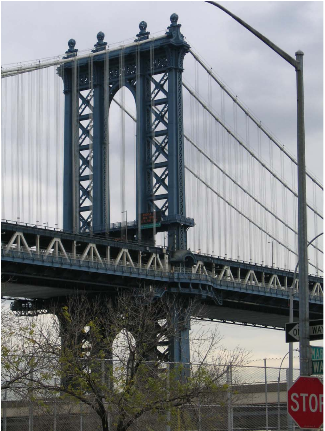
Cable/Metal Deck Platform Center Roadway Manhattan