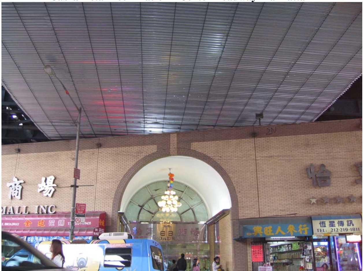
Cable/Metal Deck Platform Center Roadway Manhattan