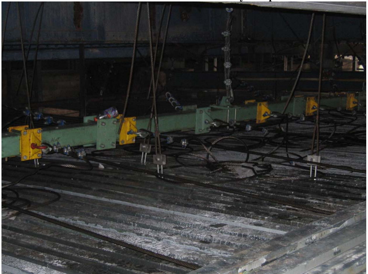
Horizontal Support Beam End Assembly